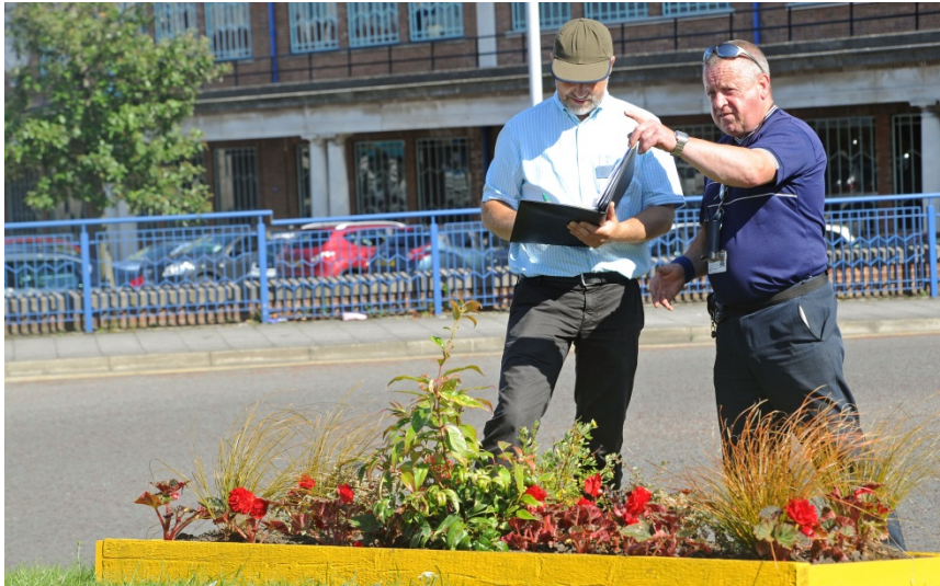
Seacombe roundabout: Seacombe resident and RHS judge

Phil from Seacombe spent countless volunteer hours working with Wirral Environmental Network to improve two roundabouts in Seacombe and create and plant up planters in Place in the Park, using recycled materials. He says ' Making Seacombe better means a lot to me, I wanted to make people proud of the community where we live, I've used flytipped materials found in and around Seacombe to create the planters'.